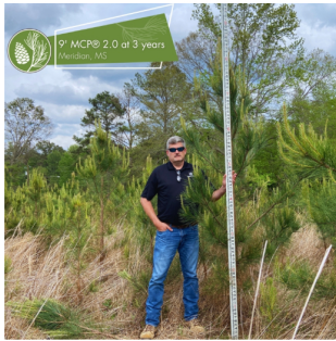
MCP® 2.0 at 3 years Meridian, MS