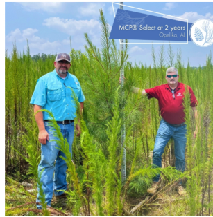
MCP® Select at 2 years Opelika, AL