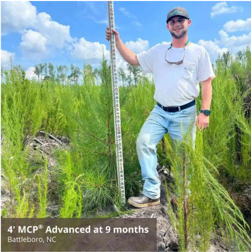
4' MCP® Advanced at 9 months Battleboro, NC