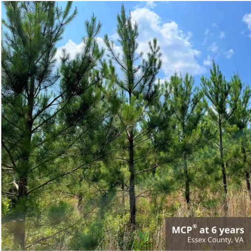
MCP® at 6 years Essex County, VA