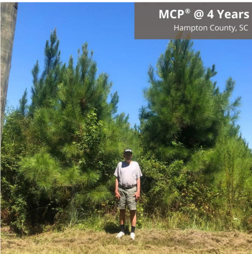
MCP® @ 4 Years Hampton County, SC