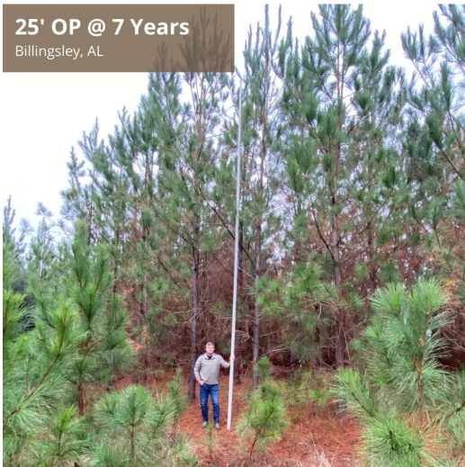
25' OP @ 7 Years Billingsley, AL