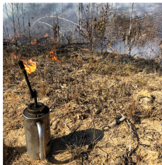
Prescribed burn site preparation in Choctaw County, Mississippi.