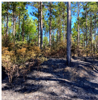
A newly burned pine plantation in Ward, Alabama shows great competition control of undesirable understory species.

Control burning costs can range from around $10 per acre to $50 or more. Landowners should consider whether this cost is necessary for a quality planting job. Spending this money on weed control and improved genetics is often better than investing a few more dollars per acre. Control burning can be a valuable tool, but consider if it is essential and review all of your options that could be better investments in the long term.