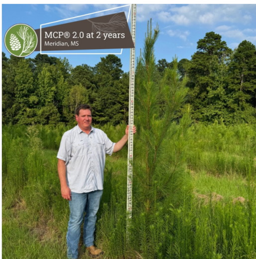
MCP® 2.0 at 2 years