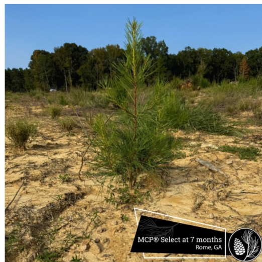
MCP® Select at 7 months