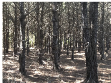
10 Yr. Old Container 2nd gen stand in SC: high number of defective trees: crooks, forks, rust galls 35% SawTimber Potential