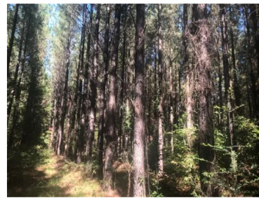
11 Yr. Old Bareroot MCP Elite Stand in AL: 90% Sawtimber Potential 3x the Value of the OP Container Stand

Just because it's in a container, doesn't mean the