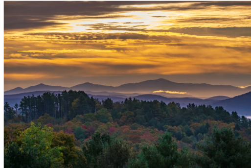
A beautiful forest enrolled in FCW Conserve.

Forest Carbon Works (FCW) makes it easy for landowners to tap into this revenue stream. As a dedicated carbon project developer, FCW helps U.S. forest owners unlock the financial potential of their forest assets. Our team of experts guides landowners through the complexities of carbon markets, managing everything from carbon measurement, reporting, and verification to credit registry, issuance and sales to earn top dollar for credits sold.