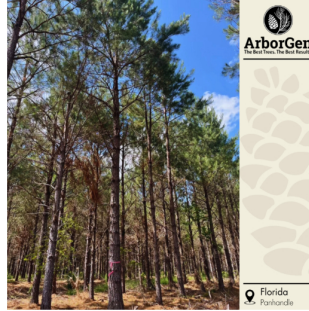
MCP® Select at 10 years Florida Panhandle