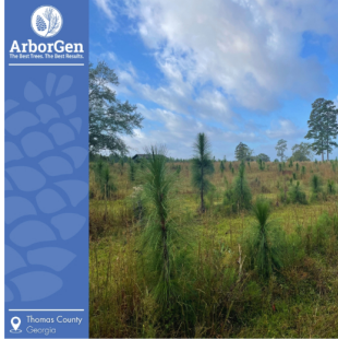
OP at 3 years Thomas County, GA