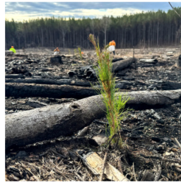
MCP® 2.0 planted in Meridan, MS

Both bareroot and containerized tree seedlings require careful handling from the moment they leave the nursery until they are transplanted in the field. Equally important is ensuring proper planting techniques. In this edition of TreeLines, we're sharing eight essential tips for maximizing survival rates, along with common planting mistakes to avoid.