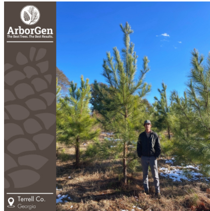
OP at 3 years