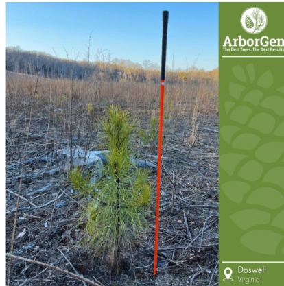
OP Elite at 1 year